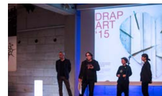
ResiduArt Awards at Drap-Art'15