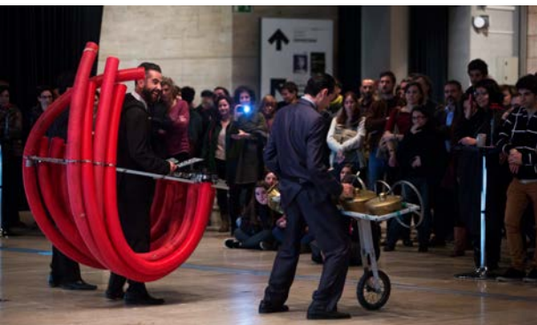
Residual Gurus, CCCB

Since that event, in which a large number of creators from very diverse disciplines met for the first time, from contemporary artists, performers, actors, designers, handcrafters, stylists and amateurs, Drap-Art has fostered and contributed to promoting in Barcelona, a global movement that also includes Art Brut and Folk art and has more and more prominent and world-renowned contemporary representatives, such as El Anatsui or Tim Noble & Sue Webster , among many others.