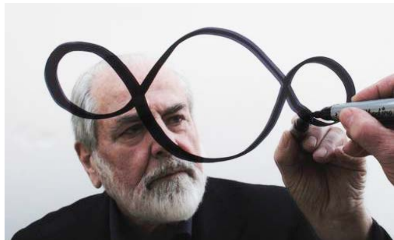
Michelangelo Pistoletto drawing the symbol of Third Paradise

The artist, a great exponent of Arte Povera , with the Cittadellarte – Pistoletto Foundation , joins this edition. Rebirth Day , celebrated worldwide on December 21, is an event that the artist organizes in different places within the framework of his Third Paradise project. His projection is a socially sustainable future, where human beings live in harmony with their environment.