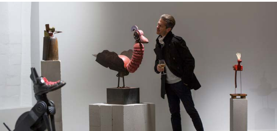
Artworks by Miquel Aparici at Villa del Arte Galleries during Drap-Art'20