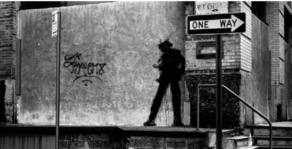
Richard Hambleton, aka Shadowman