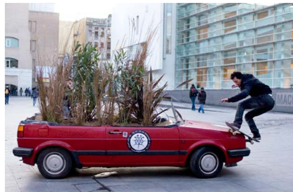
Installation by Carles Gispert at Drap-Art'09