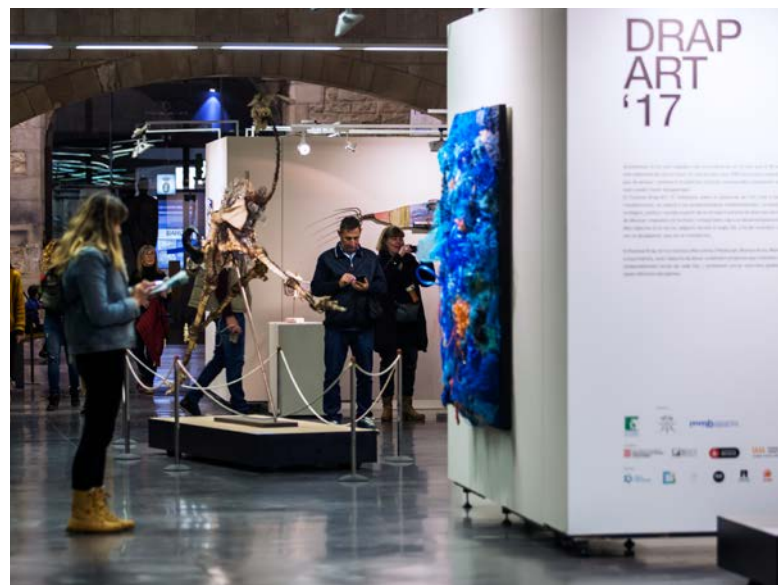
General view of Drap-Art'17

Drap-Art'21 will be held from November 18 to December 21, 2021 in various exhibition spaces in emblematic buildings, creating a cultural circuit in the Gothic Quarter, turning it into a meeting point between artists, art lovers and new audiences, and collaborating in the sustainable and inter-cultural urban transformation of the center of Barcelona.