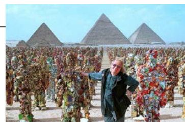
HA Schult, Trash People