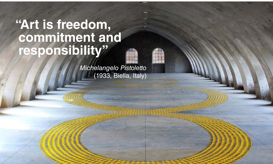
Michelangelo Pistoletto, Third Paradise installation

Michelangelo Pistoletto (1933, Biella, Italy)