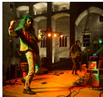
Ominira at Drap-Art'20 Al Gòtic!

With the intention of promoting the most emerging art, Drap-Art signed a collaboration agreement with the University of Barcelona to include in its festival a special call for students from the Faculty of Fine Arts of the University of Barcelona . This year they will carry out performances, artistic actions and co-creations under the motto of Public vs. Private, Reflections around Space , at Plaza del Rey during the festival, wanting to show how this relationship has changed during the pandemic.