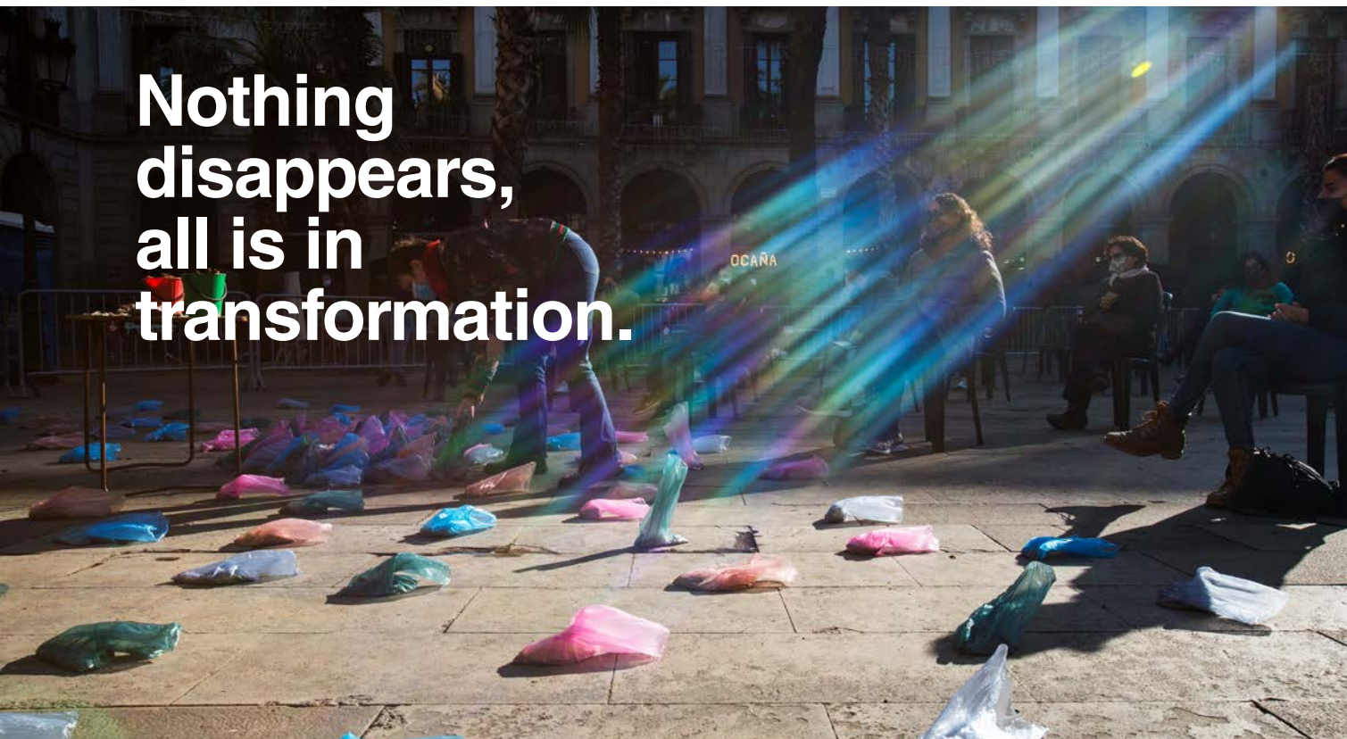
Action art by Nathalie Rey in the D'Individual al col·lectiu project

Nothing disappears, all is in transformation.