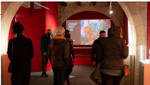
Reial Cercle Artístic

Drap-Art'21 is held from November 18 to December 21, 2021. The event will take place in various exhibition spaces in emblematic buildings creating a cultural circuit in the Gothic Quarter, making it a meeting point for artists, art lovers and new audiences, collaborating in the sustainable and intercultural urban transformation of the center of Barcelona.